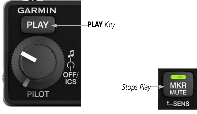
Left Knob - Pilot Volume

Powering off the unit automatically clears all recorded blocks.