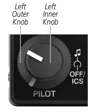
Left Knob - Pilot Volume Controls