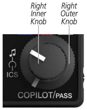
Right Knob - Copilot and Passenger Volume Controls